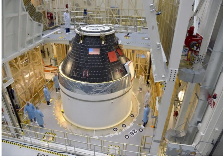
Fig 2: The Crew Module.

We humans have built spacecrafts, which travelled above the LEO (Low Earth Orbit) and studied a lot of science. So, why is Orion a Masterpiece? The Orion MPCV is a versatile spacecraft. It has highly advanced technologies compared to any other space craft's.