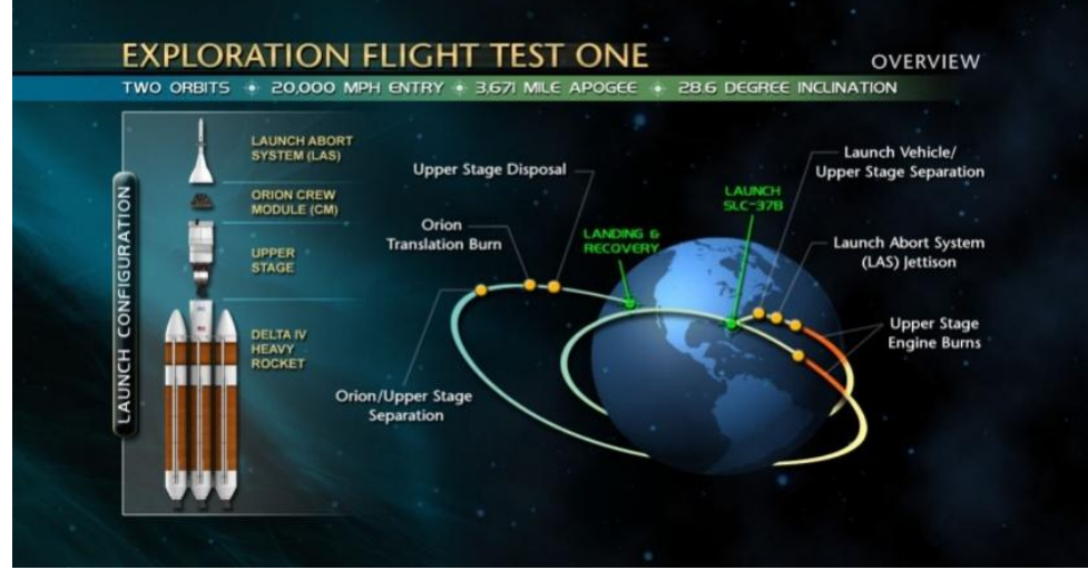
Fig 1: Launch Configuration.