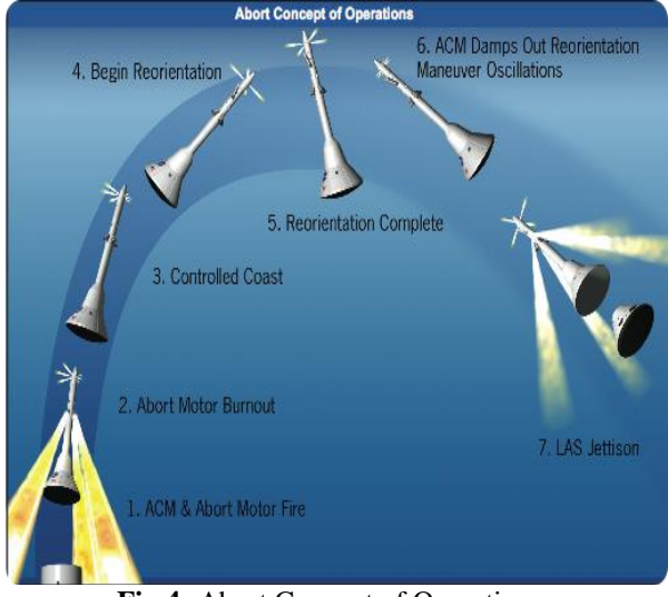
Fig 4: Abort Concept of Operations.

NASA has chosen Avcoat ablator system for the Orion's heat shield. This avcoat was also used during the earliest space flights like Apollo. When the capsule returns to Earth , the heat shield must be able to safeguard the crew from any danger.