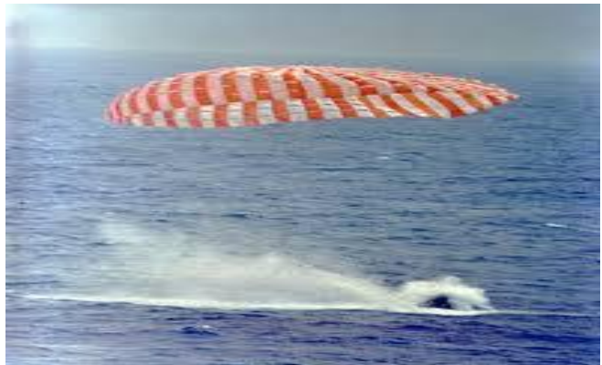
Fig 5: The Orion's Splash Down.

The module will encounter very high temperatures before the splash down. The CM will be constructed using aluminum-lithium alloy. It also has Launch Escape System (LES) so that the astronauts can safely get back. It is believed that the Orion will be 10 times more safer during the lift-off and re-entering the atmosphere. The first test flight (un crewed) was launched by NASA on December 5, 2014 using a heavy rocket Delta IV, which was successful. For the recovery of Orion crew module NASA has chosen water landings(splash down). The module is later recovered by the US Navy.